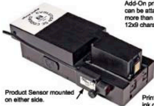
Product Sensor mounted on either side.

Add-On printhead modules can be attached to provide more than 1 line of 7x5 or 12x9 characters.