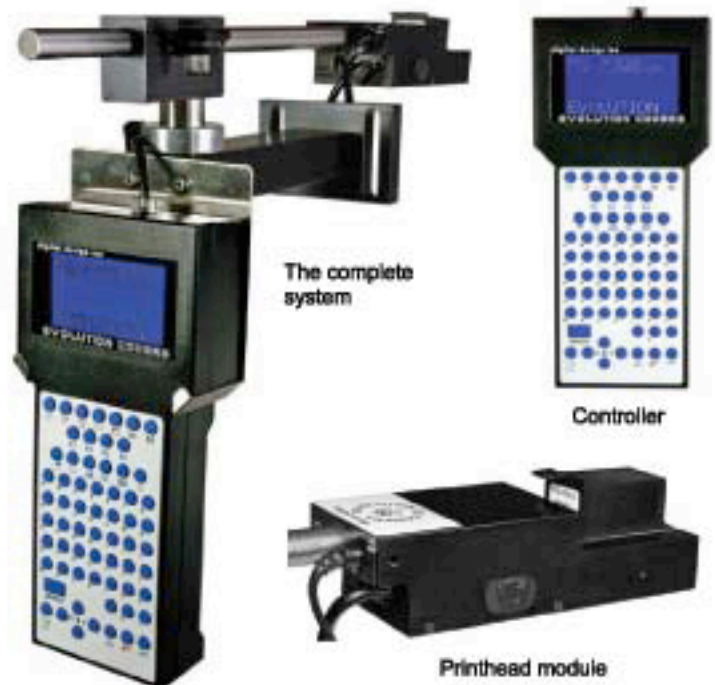
The complete system