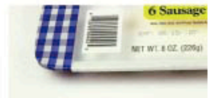
Actual printed samples with .125" character height.